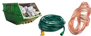
Scrap metal, wires and cables, home and construction waste.