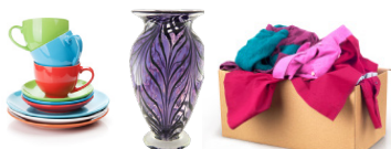
Textiles, housewares, windows, ceramics, and other reusable items.