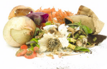
Organic, kitchen, yard and animal waste.

Unacceptable items - These items are NOT accepted with your recycling and require alternative handling.